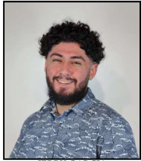
JERRY GARCIA as Doo Wop Member